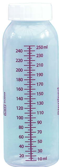
250ML REUSABLE BOTTLE