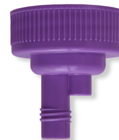
FLOCARE UNIVERSAL ADAPTOR