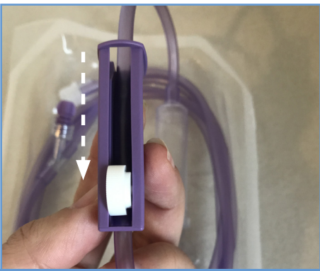
Completely close the roller clamp.