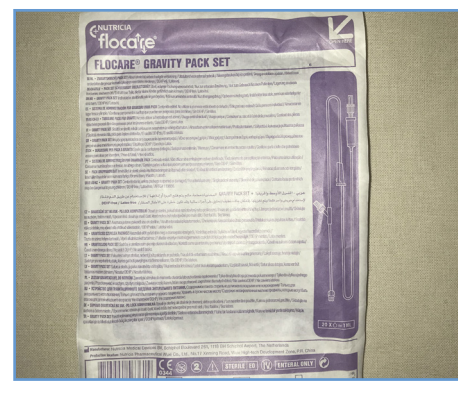
The Flocare gravity pack set is compatible with all Nutrison products as well as Flocare containers.