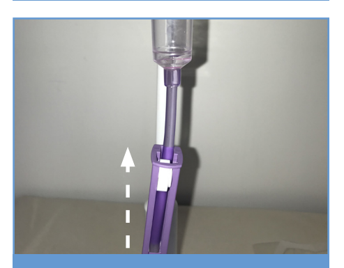
Slowly open the roller clamp to fill the set and expel air to end of the set.