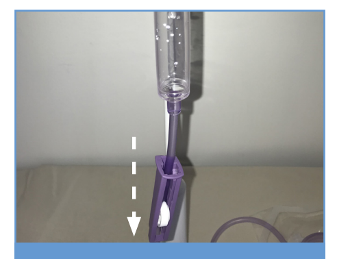
Then fully close roller clamp again.

Regularly check the feed container to ensure the flow rate is correct and the feeding container does not empty completely.