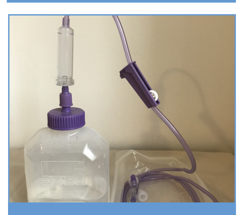
Connect to the feeding container.