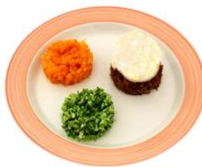
Level 5 Minced and moist