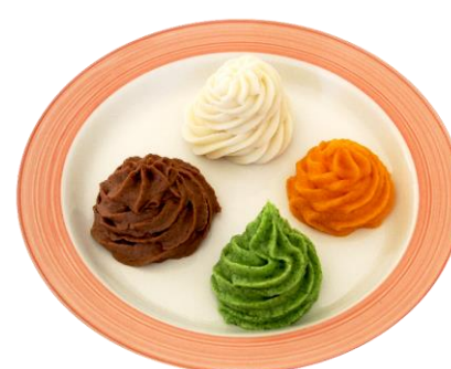
Level 4 Puréed