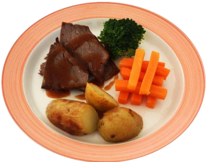
Level 7 Regular/Easy to Chew