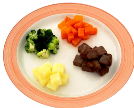
Level 6 Soft and bite-sized